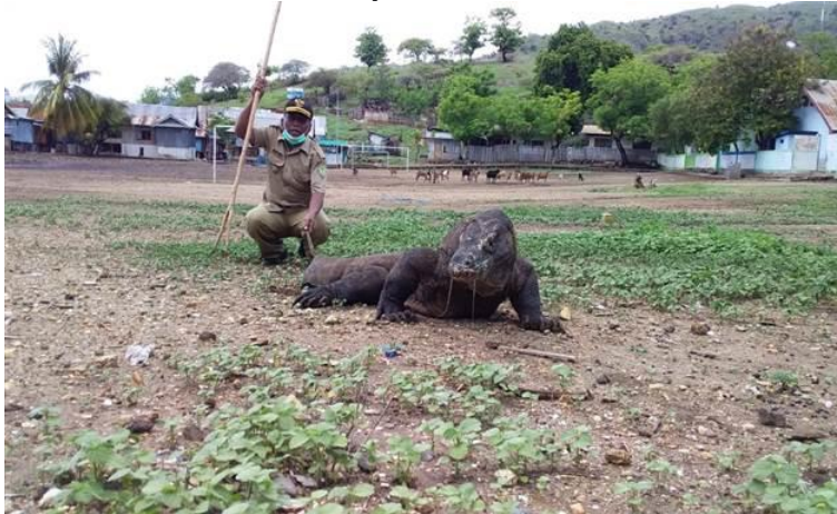
Figure 5: Village Head with Komodo (source of village head documentation)

Some people call it the thousands of deadly bacteria that are in the saliva of his mouth. But there has been a rebuttal from some poison research scientists from the University of Melbourne in Australia saying that "all bacteria are scientific fairy tales," said Bryan Fry. (Source: This is written in his quote by Bryan Fry in National Geographic "Komodo Dragons Kill With Venom). Komodo Island, which is a natural habitat and is a very famous tourist destination, does not only have Komodo as its attraction.