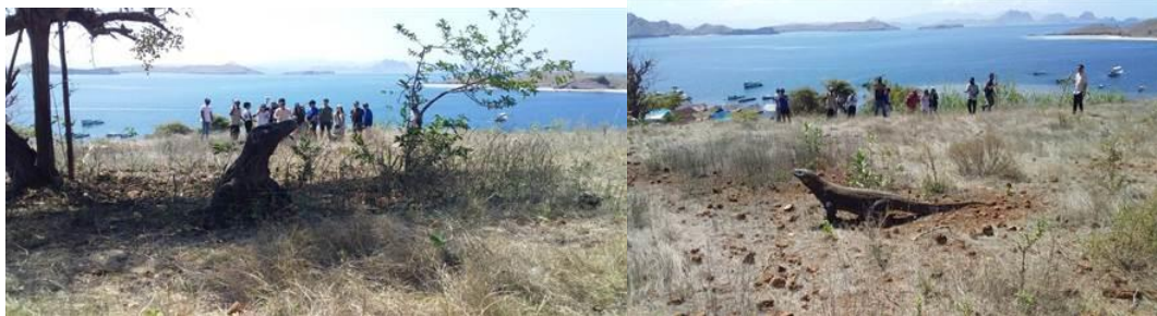
Figure 4: Komodo is a tourist attraction

This is a special attraction for tourists, namely the relationship between rare animals living in peace with the local community.