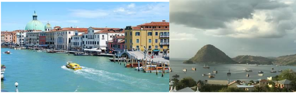
Picture 3 B : The beauty of downtown Venice has a long history. So the attractions and places of interest here are the classic buildings and urban planning. Mainly because of the many canals and bridges

That the city of Venice and Labuan Bajo have similarities, namely the atmosphere of classic buildings and urban planning located near the sea, only Venice is famous for the city of water, with classic buildings surrounded by water, is the main attraction. The uniqueness of Labuan Bajo has a uniqueness with the attraction of the sea and the mountain into one.