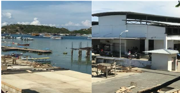
Image 1 : construction of a culinary center, Labuan Bajo fish market, 2021

modern and can become one with the sea, so it has more value to make it a photo spot, culinary and witnessing fish trading activities that attract tourists.