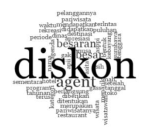
Figure 4. world Cloud travel agent discount

Tour and Travel not only offer various packages but also discounts on several services. Travel and other discounts are included in the tour packages offered to tourists. The company also provides promos and values based on tours, places, tourist, or consumer destinations.