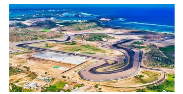
Figure 3. Pertamina Mandalika Circuit

forecasts may be out of date and ineffective in crises. So those accurate forecasting methods for academic and business purposes are needed(Zhang et al., 2021). Therefore, the World Super Bike (WSBK) is an international event held in West Nusa Tenggara Province and is a preliminary event before the MotoGP is born in 2022. The provision of tickets is estimated at twenty thousand tickets from all over the world. one of the efforts of the West Nusa Tenggara government to immediately organize a World Super Bike to bring in foreign and domestic tourists to visit tourism in Lombok.