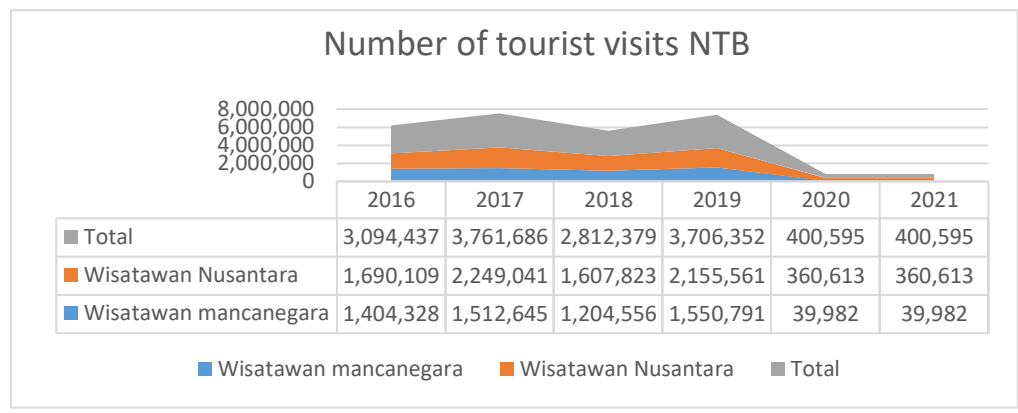
Figure 1. Number of West Nusa Tenggara tourist visits

drastically with the absence of foreign tourists and a lack of local tourist visits. (Butcher, 2021)The global COVID-19 pandemic has had an impact on the tourism industry, especially West Nusa Tenggara. The tourism industry in West Nusa Tenggara has been paralyzed due to a lack of preparation for this tragedy. Due to the closure, the tourism business has suffered. Flights, travel reductions, and strict object closure rules. Tourism 2019 is part of the need for travel people (Chang et al., 2020).