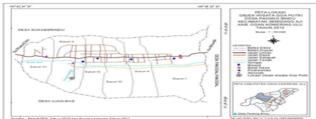
Picture 4.1. Map of Padang Bindu Village

The same statement from community leaders indicated that Padang Bindu Village was originally a big wilderness, and that there are multiple caves in Padang Bindu Village that are now known to the public as Putri Cave. Goa Putri is the community's pride in Padang Bindu Village. The following map graphic depicts the location and extent of Padang Bindu Village.