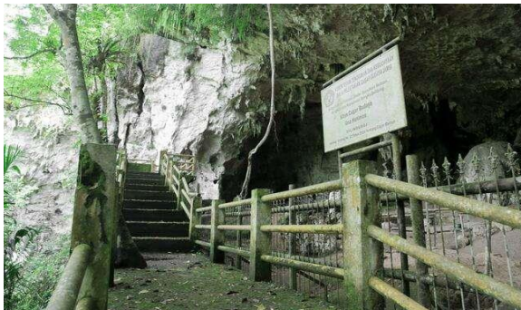
Picture 4.3.3 Fossils of Ancient Humans