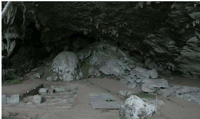
Picture 4.3.1 Condition in Goa Harimau

Tiger Cave, one of the caverns found in the settlement of Padang Bindu, 35 kilometers west of Baturaja , was discovered in 2008 and began to be researched in 2009. The name Goa Harimau comes from the fact that this cave is frequented by tigers. The National Archaeological Research Center began evacuating the Goa Harimau in 2010. The findings of this investigation are really intriguing. Over a four-year period (2010–2014), at least 78 human skeletons were discovered buried in various positions, replete with grave materials. In addition to human skeletons, stone tools, animal remains, and fauna were discovered in the cave. Pottery and metal relics show that there was prehistoric life in the area. Before the concrete stairs to Goa Harimau were completed, people had to struggle up the hillside with a slope of up to 45 degrees to get to this place.