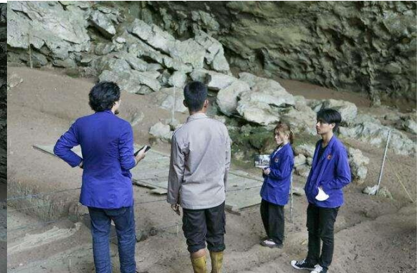
Picture 4.3.4 Interview in Goa Harimau

Picture 4.3.1 the general shape of the tiger cave seen from the top of the stairs. The fossils that have been found are Mongolian and Austral Melanesoid human remains. The fossils in the Goa Harimau have been replaced by reproductions, limiting the possibility for damage to the actual fossils. While the original fossils have been transferred into the Goa Harimau museum.