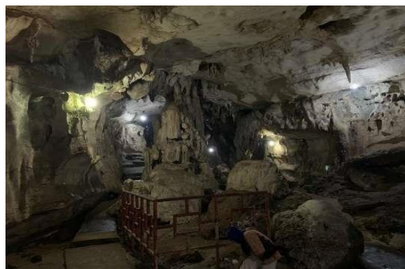
4.2.2. Condition in Goa Putri

As shown in Figures 4.1.1 and 4.12, is an attractive environment, pleasant, and great service to attract visitors who visit in accordance with local wisdom and community knowledge, optimizing the local wisdom of the people of Semidang Aji Village that makes tourists comfortable when visiting.