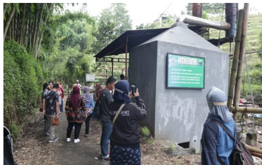
Figure 3: Waste Management Incinerator Machine