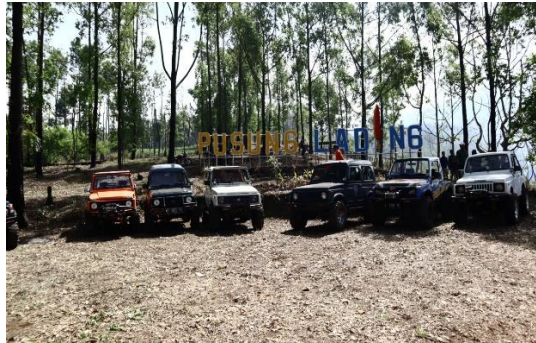
Figure 2: Pusung Lading Nature Tourism