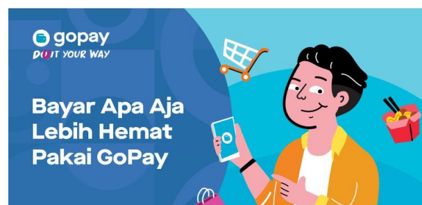
Figure 3.2.2 The example of strategy promotion direct marketing with website distribution