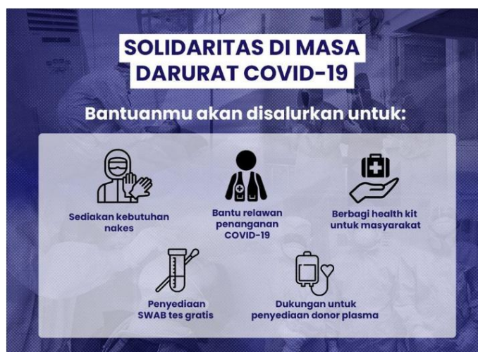
Figure 5.1.4 The example of sales promotion