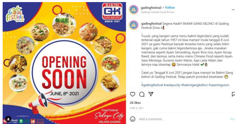
Figure 2: Poster posted on Instagram account @gadingfestival on June 6, 2021

Hashtags are one of the items available on Instagram. Hashtags have a function to categorize content or topics and make it easier to find according to the hat you want to meet. By doing a hashtag search in the search option to find which topics you want to search for and then clicking on it, Instagram will display all posts that contain that hashtag in the photo caption. Hashtags are symbolized by a hashtag sign (#).