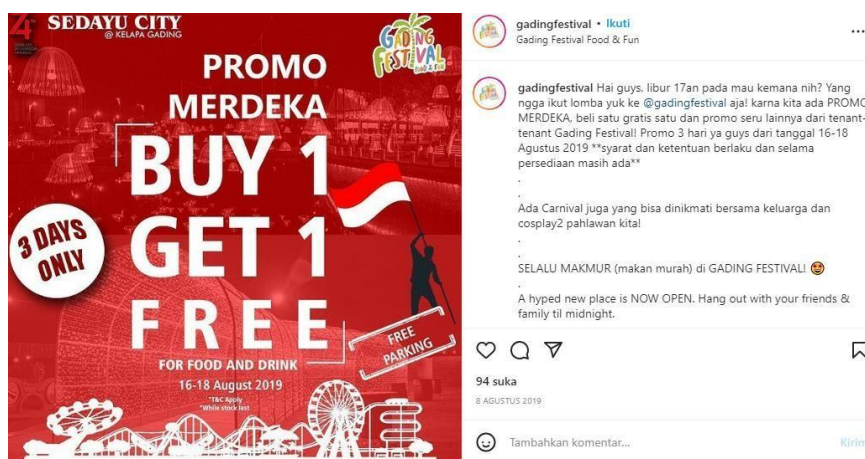
Figure 1: Poster posted on Instagram account @gadingfestival on August 8, 2019

On the poster in Figure 1, it is explained that there is a special promotion in honor of Independence Day, which is buy one get one free for food and drinks only for three days. Then there is the information regarding the date, the location, and the details of the free parking. Although the caption in the upload provides an explanation of the poster and is still related to it, neither the poster nor the caption explains what kinds of food or drinks will be offered at the festival.